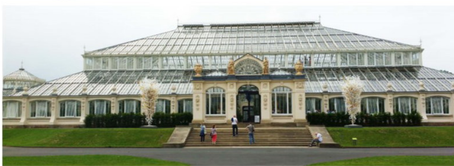
The centre section of the Temperate House

Members and friends had a wonderful day at Kew Gardens 25th June. On arrival everyone boarded the Kew Explorer for a whistle stop tour around the gardens before splitting up to see whichever features captured their imagination. The Great Broad Walk Borders were a riot of colour and the newly refurbished Temperate House complete with Dale Chihuly glass sculptures was stunning. The day was not nearly long enough to fully explore these historic gardens. 'When can we go back again?' was the question going round the coach on the way back.